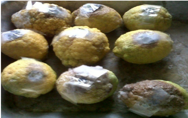
Plate 3: Pathogenicity tests on Citrus limonum