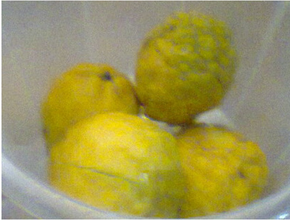
Plate 1a: Healthy lemon