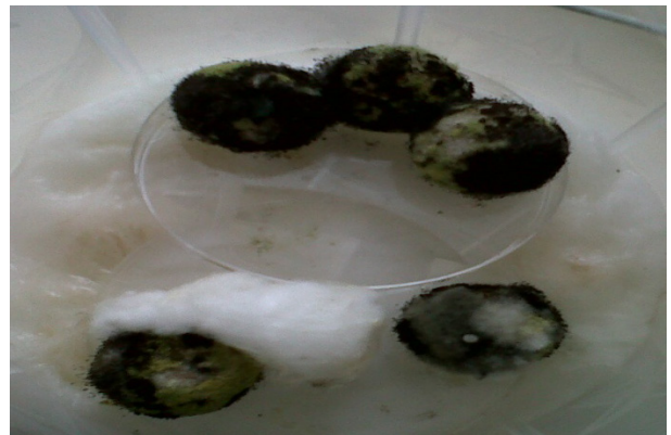
Plate 2b: Fungal growth on lime