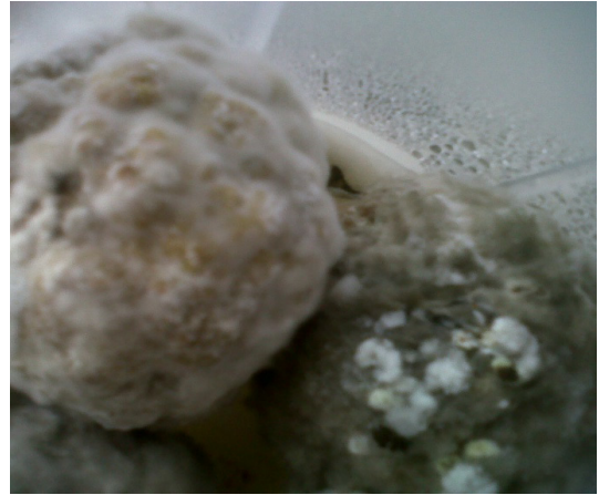
Plate 1b: Fungal growth on lemon