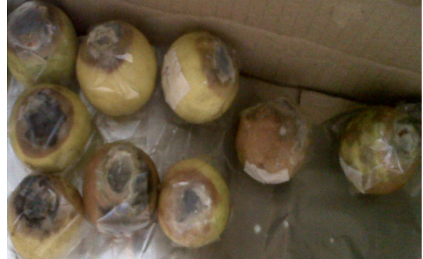
Plate 4: Pathogenicity tests on Citrus aurantifolia