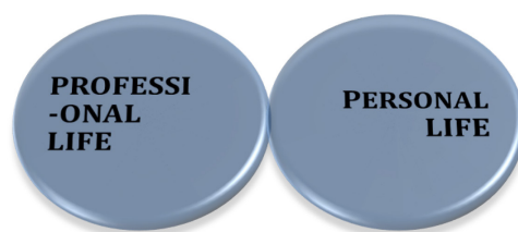
FIGURE 2: WORK LIFE BALANCE

All branches and administrative offices throughout the country sponsor and participate in large number of welfare activities and social causes. Bank's business is more than banking because we touch the lives of people anywhere in many ways. Bank's commitment to nation-building is complete & comprehensive [9].