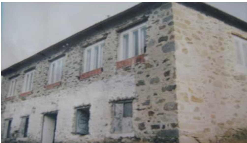
Figure 2. Basic School of rotting Potok was built in 1957- resist the ravages of time.

Extremely high number of people with no income (46), lack of population with income - employees (6) pensioners (17), reflects the most economic backwardness and lack of investment in this rural village.