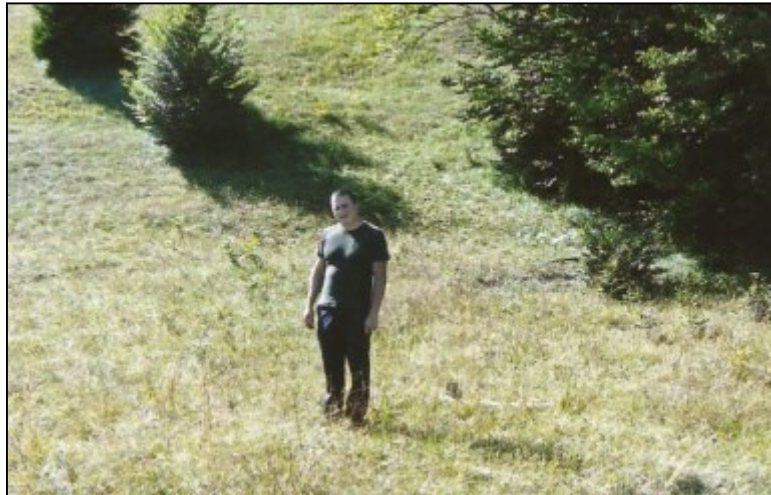
Figure 1. Perinka – are here to live ancient people? 1

manner. The first is located above the Kagina Ornice - plateau in a circular shape named Korita, the other named Rajkova Plains, the third Perinka in owned Dragoja Krstova Rajović, which is located between the Kraja and Dola Novović. It is interesting to point out that the last two plateaus have a circular shape, and both the edges of their spring water. "It appears likely that these sites were the habitat of some of the livestock of the village from the old times [3].