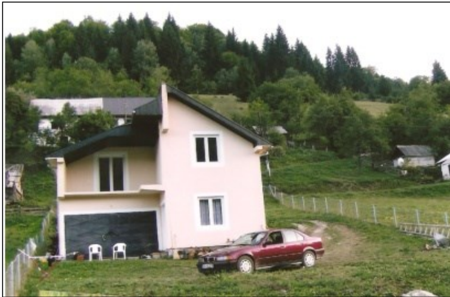
Figure 3. Modern house built in 2007 - Partially housing.

How is Gnjili Potok of the seventies of the twentieth century, the depopulation reached proportions that can hardly be stopped, a number of residential properties (5), and a trade (the former State general store), abandoned and left to chance and natural aging. On the other hand, there is the problem of seasonal or occasional use housing units (houses). Such is the rotten Potok 37 Accordingly, the former permanent resident's Gnjili Potok only summer or winter, come and spend a certain time in the form of vacation or partial housing.