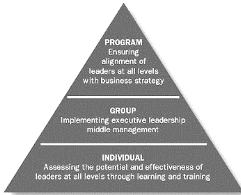
Figure 1. Results-focused leadership development