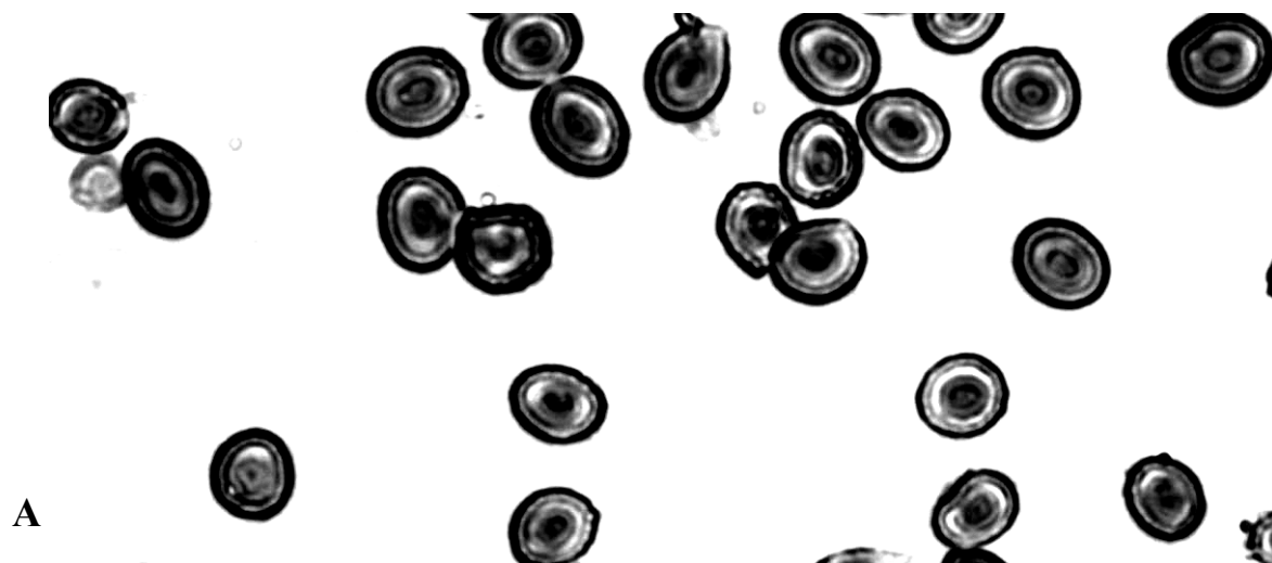
Figure 1. A. Normal and B. Micronucleated (indicated arrow) peripheral erythrocytes of catfish, H. fossilis (Bl.) after acute in-vivo exposure of zinc.

a Mean ± S.D; n = 10. *P < 0.001 (compared between control vs. all zinc concentrations) γ P < 0.001 (compared between 10 ppm vs. 30 ppm zinc concentration).