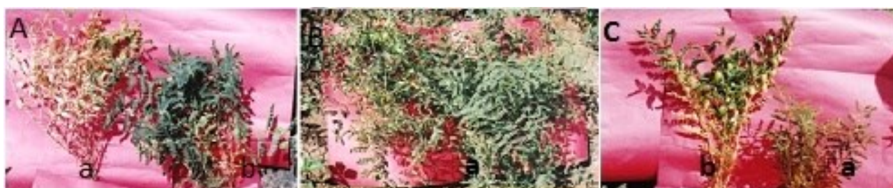
Fig. 2. A. Early mutant, B. Spreading mutant and C. Miniature mutant (a- mutants and b-control).

Flower mutation - Open flower mutant: This mutation was isolated from the M 2 progenies of Vishwas treated with EMS (12 and 16 mM conc.) and gamma radiation (400 and 600 Gy) treatments. This mutation had bell shaped flower with open keel. Stamens and androecium of these flowers were exposed. The mutants were early in flowering.